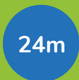
24M VIEWING DISTANCE