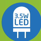
RATED WATTAGE: 3.5