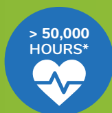
LONG LIFE NiCAD BATTERY

Can be used as both an exit light and emergency light