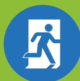
WHITE + 4X RUNNING MAN DIFFUSERS INCLUDED