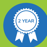
2 YEAR WARRANTY*