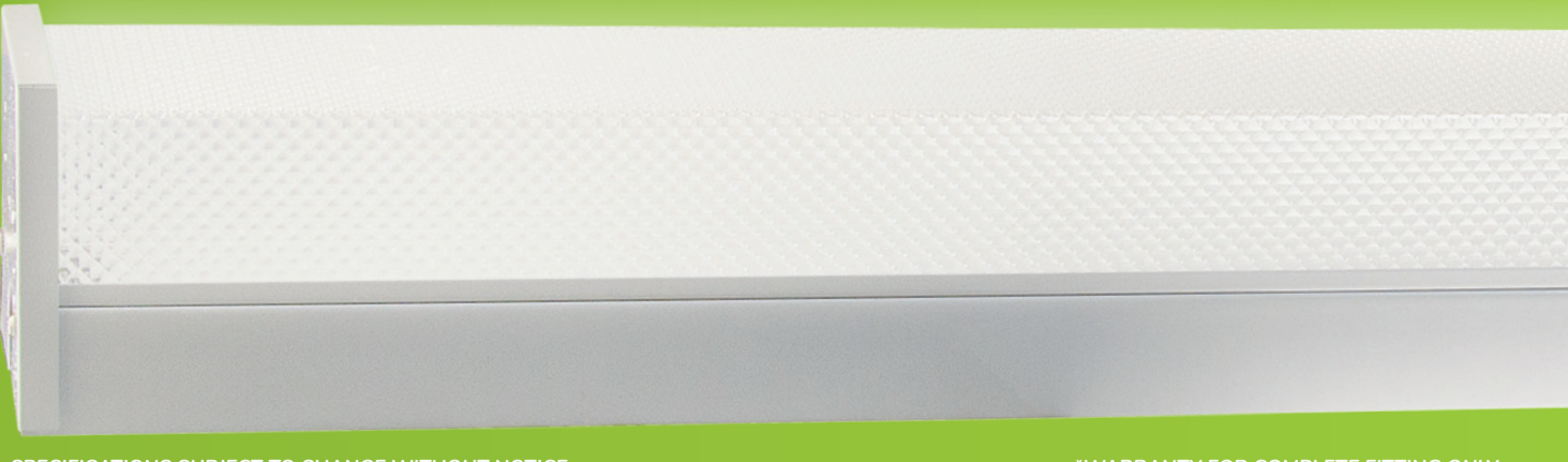
SPECIFICATIONS SUBJECT TO CHANGE WITHOUT NOTICE