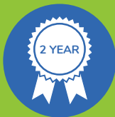
2 YEAR WARRANTY*