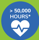
LONG LIFE NiMH BATTERY