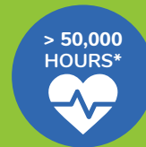
LONG LIFE BATTERY