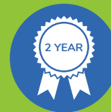
2 YEAR WARRANTY*